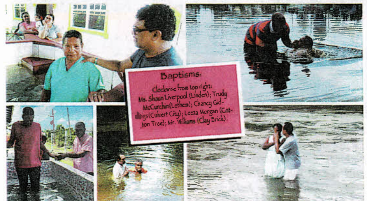
Baptisms from Culvert City, Cotton Tree, and Blueberry Hill!