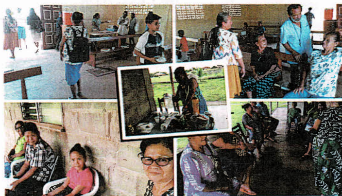
Additional fellowship gatherings in July and August. Love it!!!!